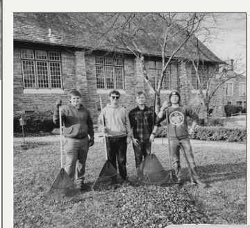
BC Football Team (above) Scouts (left) BC National Honor Society and Gardeners (below)